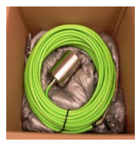
Height: 32 cm Diameter of cable 11 mm